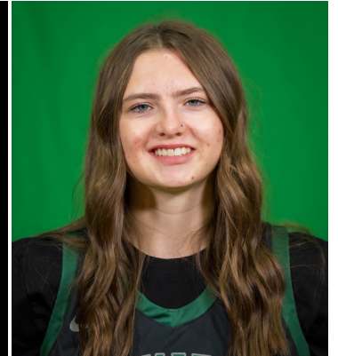
Position G Year Freshman High School Oakridge Hometown Oakridge, OR