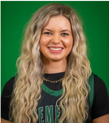
Position F Year Sophomore High School Gervais Hometown Keizer, OR