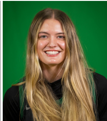
Position F Year Sophomore High School Springfield Hometown Springfield, OR