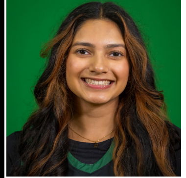
Position G Year Sophomore High School West Salem Hometown Salem, OR