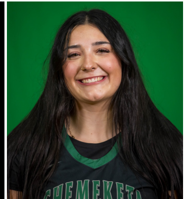
Position F Year Sophomore High School Country Christian Hometown Canby, OR