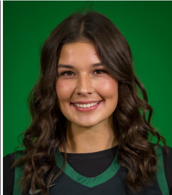
Position G Year Freshman High School McNary Hometown Keizer, OR