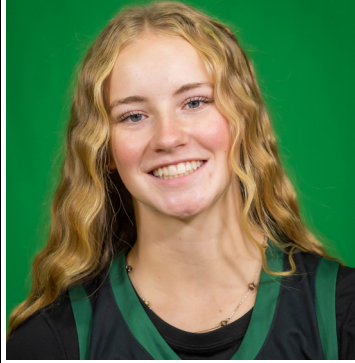
Position G Year Freshman High School Corbett Hometown Corbett, OR