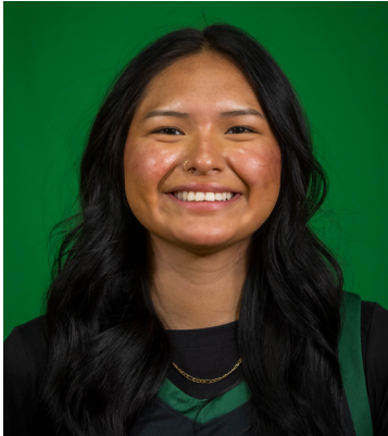
Position G Year Sophomore High School Yakama Nation Hometown Toppenish, WA