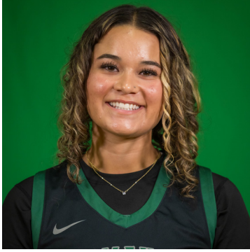
Position F Year Freshman High School Santiam Christian Hometown Albany, OR